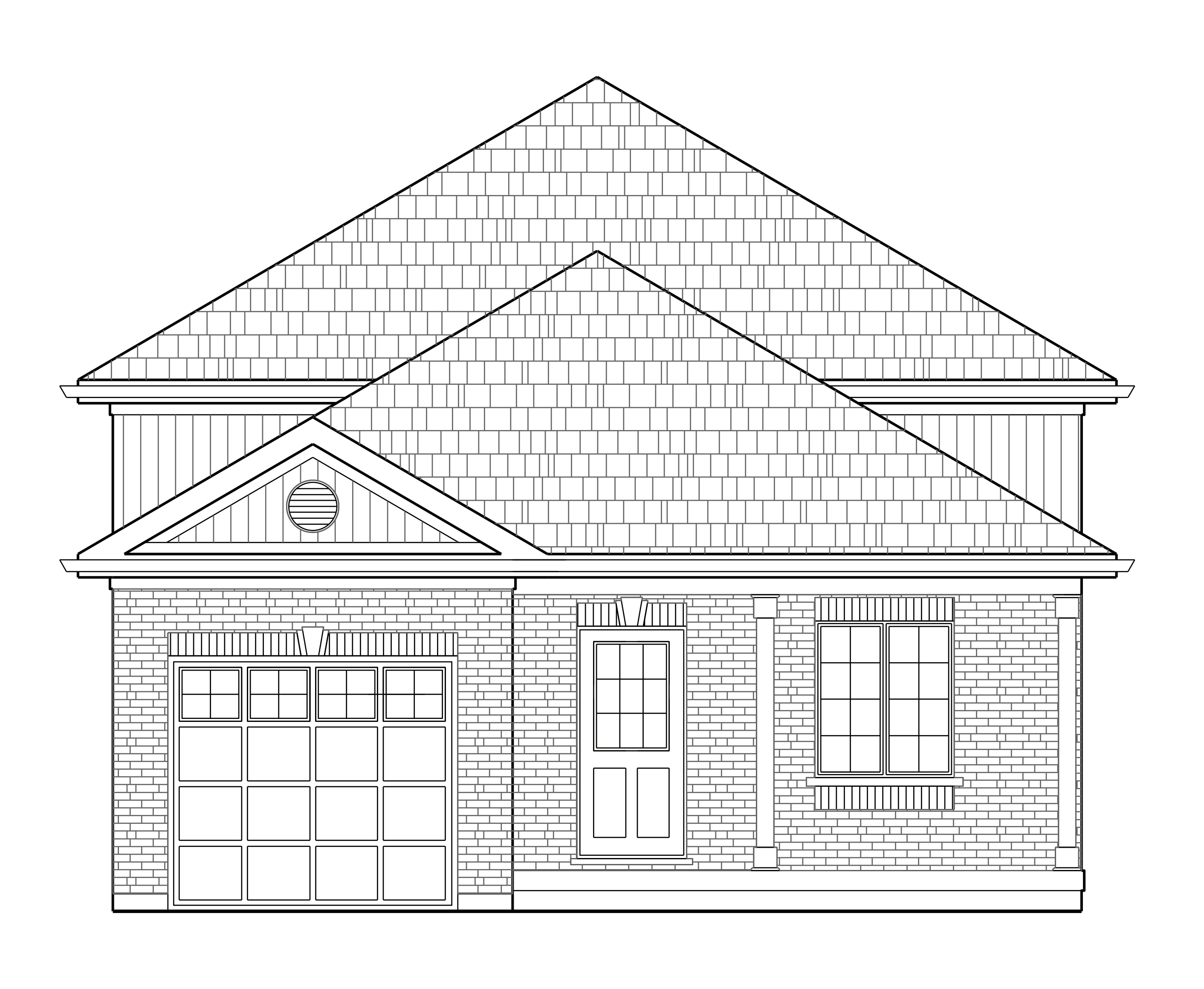
Front Elevation A